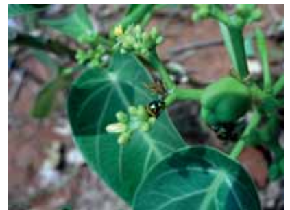
Jatropha maheshwarii , Euphorbiaceae

J maheshwarii , an endemic species found in the southern parts of India, holds potential pharmacological benefits that are yet to be exploited. Rural folks along